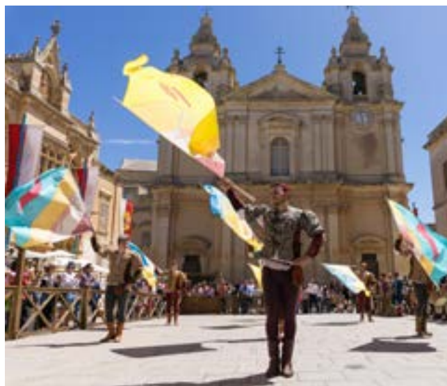
Centuries of history