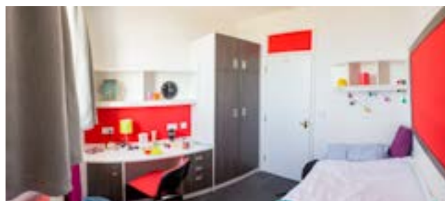
Comfortable bedrooms in Roedean