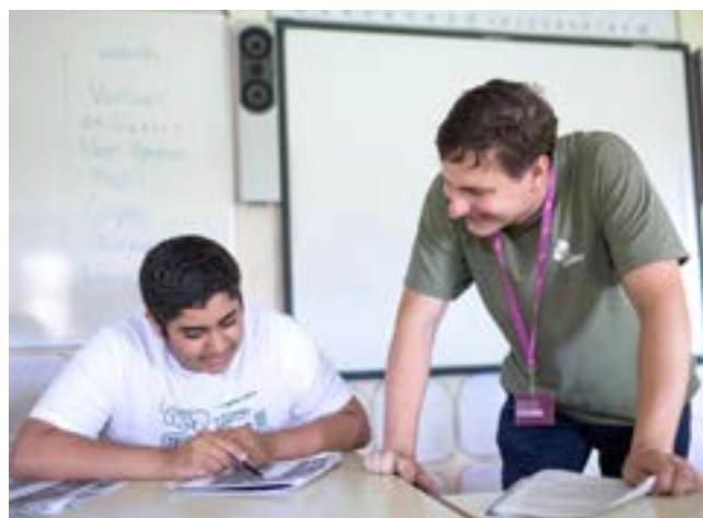
Individual attention – Roedean

“I made a lot of friends. I want to say that the people that are part of EC Academy are now my family.