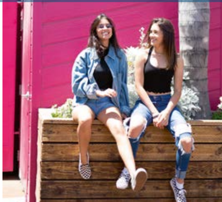
Having fun downtown

UCLA has 16 dedicated recreational and athletic facilities, including a fitness centre, numerous swimming pools and much more!