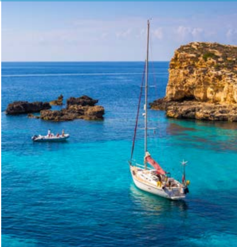
A range of activities in Malta