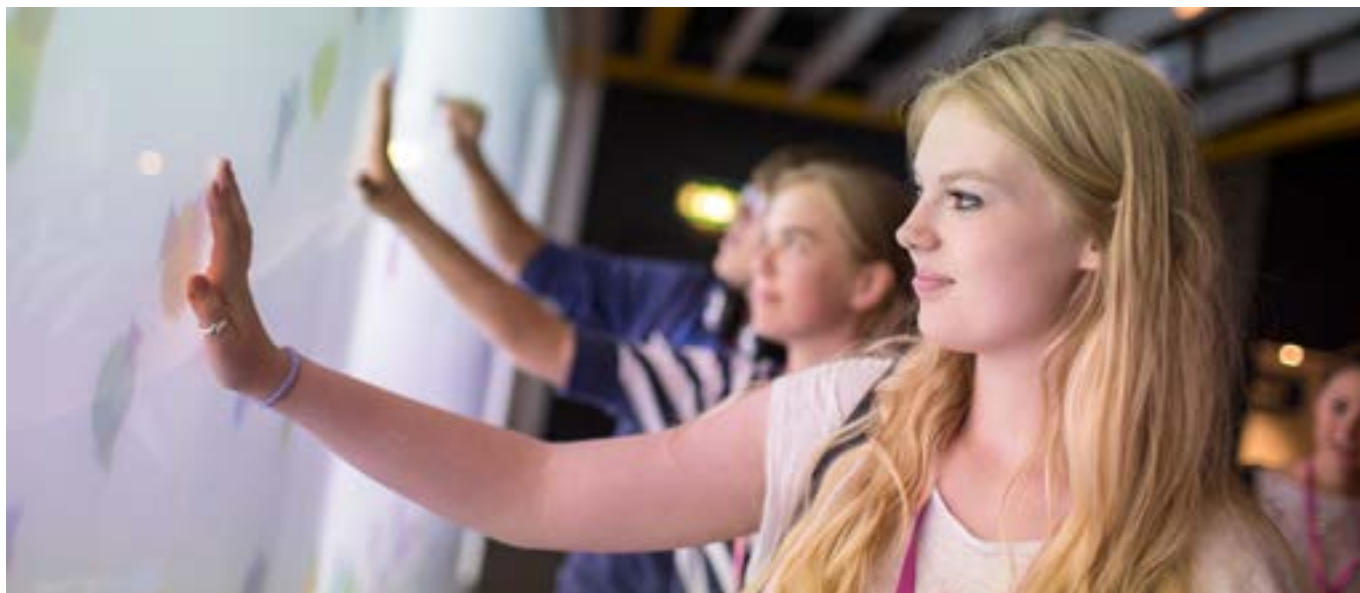
Interactive lessons in LA