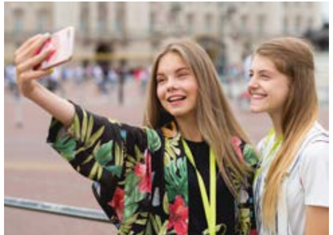
Embassy Summer students

During a summer with Embassy, students will not only improve their English language skills but they will also develop skills for life! At our centres across the UK and North America we deliver rewarding summer language programmes for young learners, providing a truly life-changing experience. Students make new friends from all over the world and take part in a wide range of activities and cultural excursions.