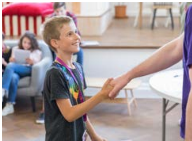
Support always available – Roedean