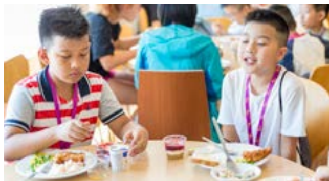
Full-board meals at Roedean