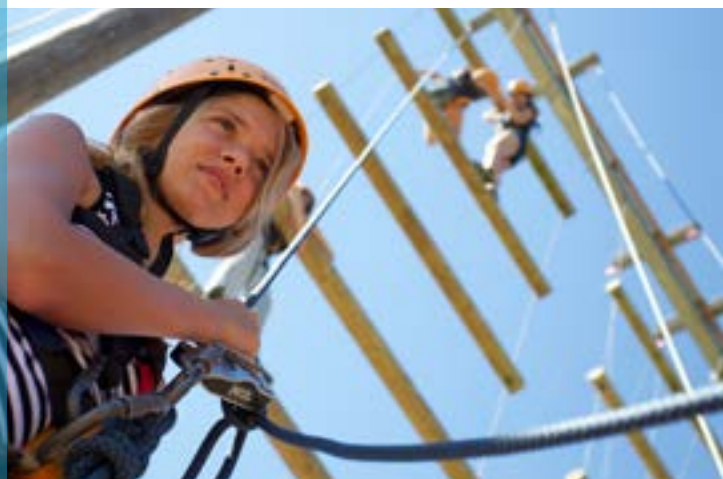
An adventurous summer at Roedean

Professional instructors will focus on developing students' techniques and skills required to progress in their chosen specialised course with fun and enjoyable sessions. At EC Academy we strive to ensure that every student leaves with confidence in their newly developed or improved skills and with a real sense of achievement.