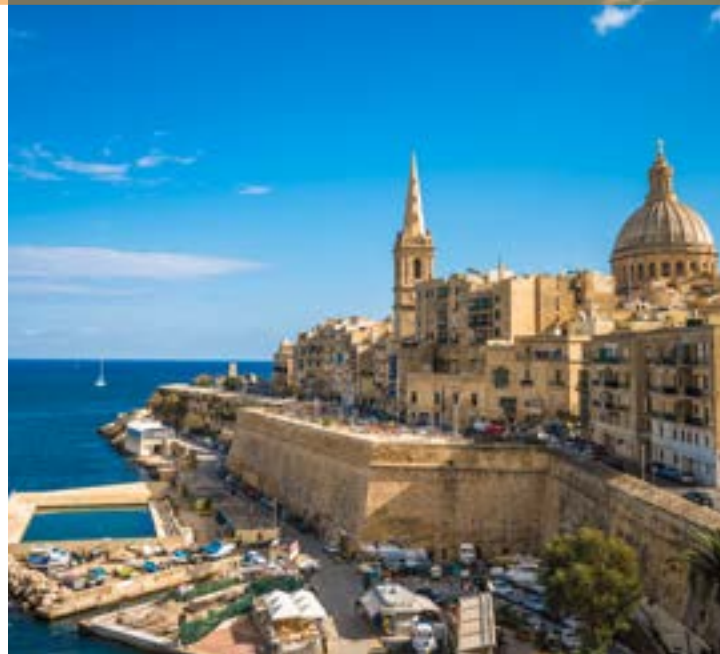
Valletta, a UNESCO world heritage site