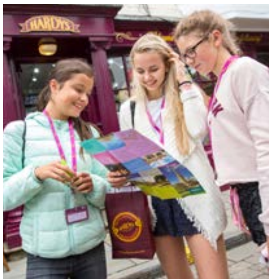
Opportunities to explore in Brighton